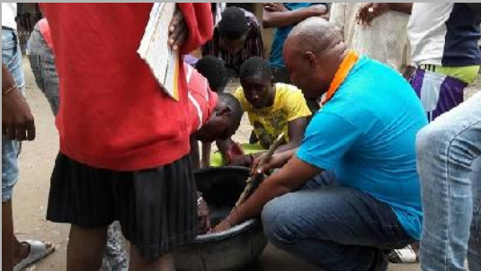
The instructor shows the boys what to do