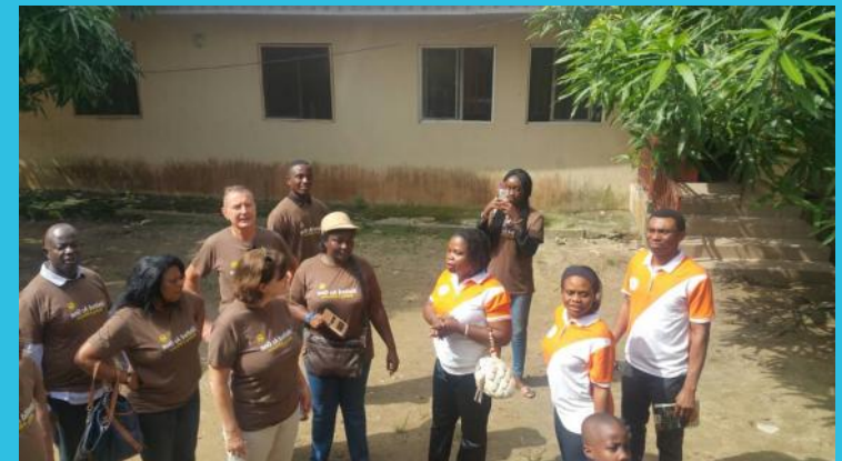
UPS visitors being shown around by the PM and CLL staff