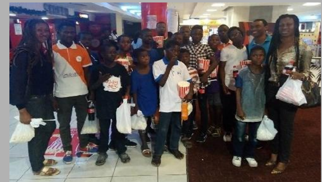
16 of the boys accompanied by 2 staff members enjoyed a film and snacks afterwards!