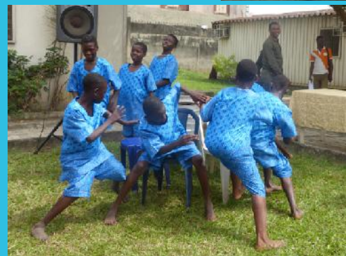
A singing and dancing performance by the children